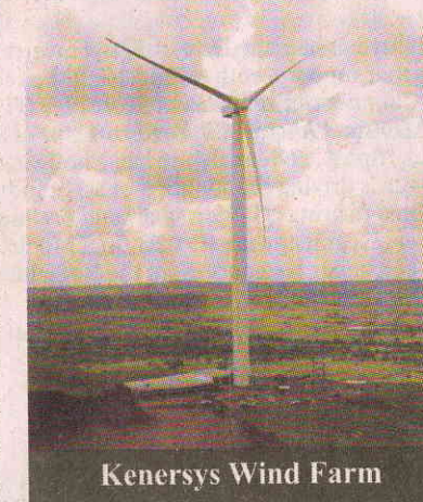
Kenersys Wind Farm