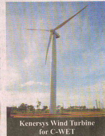
Kenersys Wind Turbine for C-WET

Operation and Maintenance of wind turbines in most of the wind rich states like Tamil Nadu, Maharashtra, Gujarat and Karnataka and would penetrate into other markets like Rajasthan, Madhya Pradesh, Kerala & Andhra Pradesh down the line.